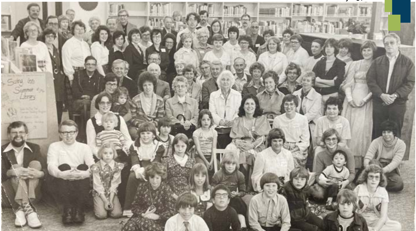
Cedar Mill Library 1978

Join us to celebrate our 50 th Anniversary at Cedar Mill Library September 14, 10:00am-12:00pm.