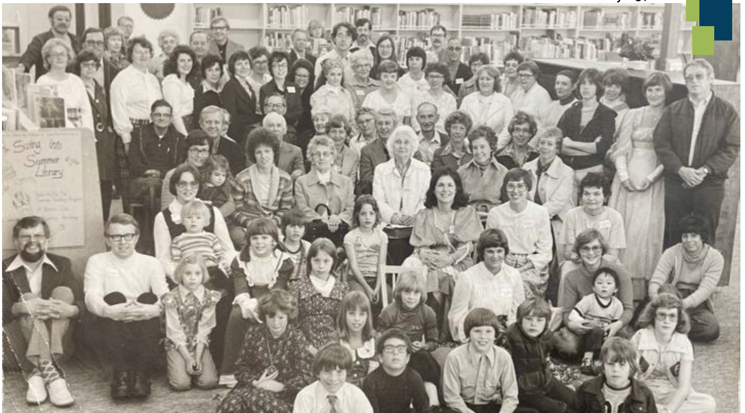
Cedar Mill Library 1978

Join us to celebrate our 50 th Anniversary at Cedar Mill Library September 14, 10:00am-12:00pm.