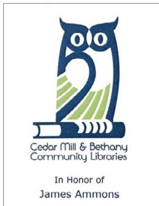
Tribute Book Plate

Learn more about at library.cedarmill.org/support .